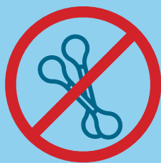
Cotton (Cotton swabs or balls)