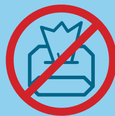
Wipes (Baby or flushable)