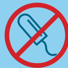
Feminine hygiene products